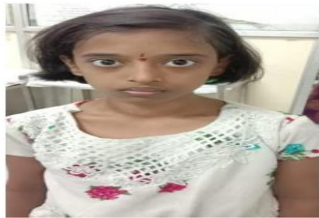
Figure 1: Bilateral exophthalmos

Key words: Hyperthyroidism, Graves disease, Thyroid, Methimazole, Propylthiouracil, Radioactive iodine.